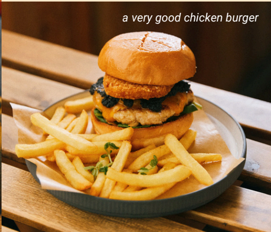
a very good chicken burger