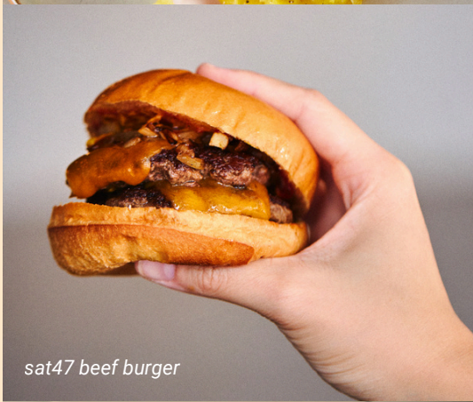
sat47 beef burger