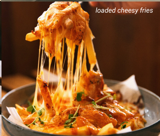
loaded cheesy fries