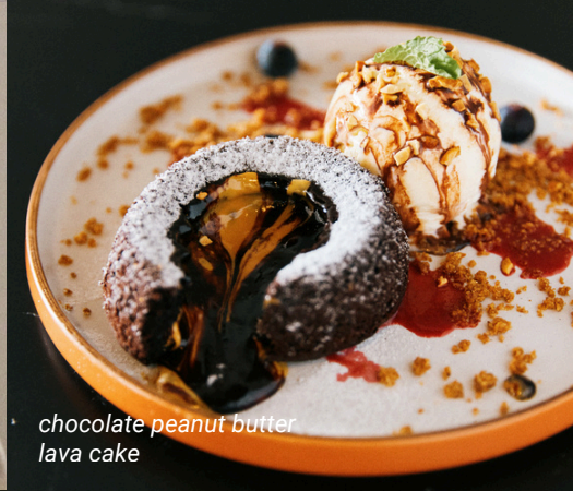
chocolate peanut butter lava cake