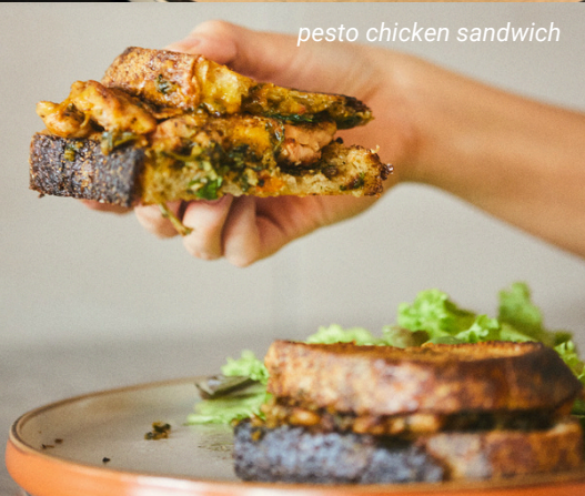
pesto chicken sandwich