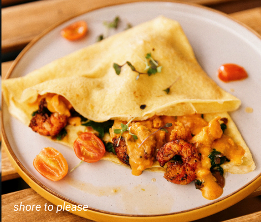
shore to please