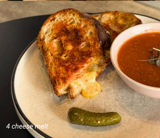
4 cheese melt