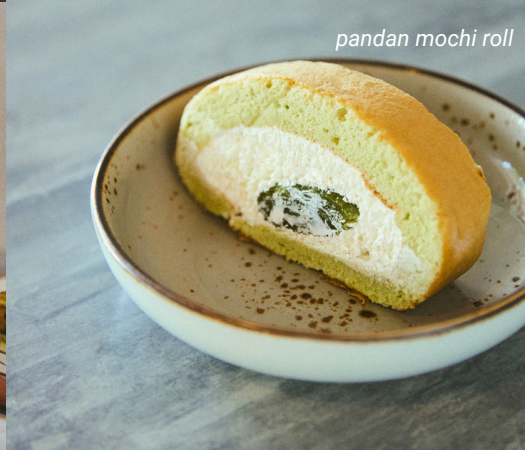
pandan mochi roll