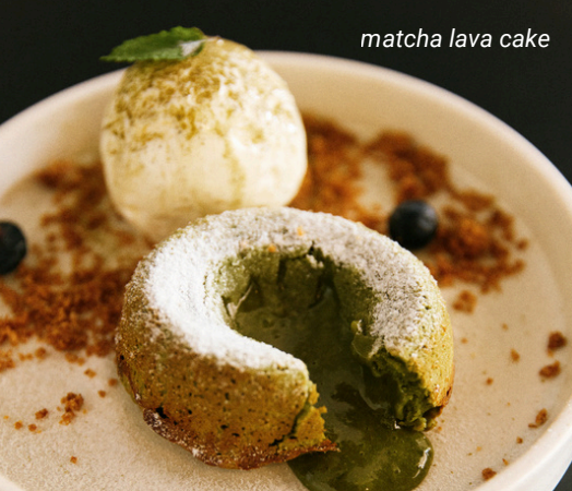
matcha lava cake