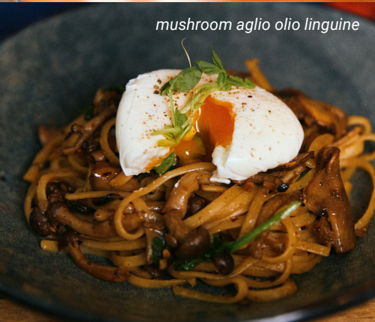
mushroom aglio olio linguine