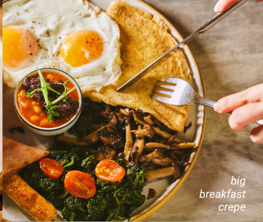
big breakfast crepe